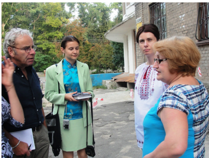
Interaction with representatives of ACMH in Rubizhne

The report was prepared after the debriefings in Kyiv and was submitted to SDC and UNDP/MGSDP Kyiv in September 2011.