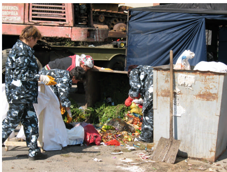
Analysis of solid waste composition in Tul'chyn (step 2)

The process is coordinated and steered by the SWM Working Group of representatives of SDC, DESPRO and MGSDP. Regular consultations should take place with the SWM expert in Switzerland. Currently step 2 and 3 are in process.