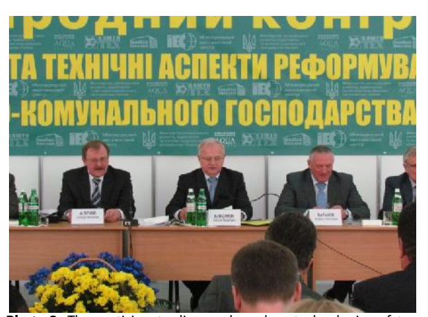
Photo-2: The participants discussed modern technologies of tap water purification, utilization of precipitation, energy saving, housing reformation, water resources and ecology protection, investments into plumbing modernization

On June 6 to 10 the UNDP/MGSDP participated in the Congress on housing and municipal economy, held by the Ministry of Regional Development, Construction and Housing and Municipal Economy in Yalta. The event included the participants from the Ministry of Ecology and Natural Resources, Ministry of Economic Development and Trade, Ministry of Health protection, Emergency Ministry, Ministry of Energy and Mining, National Academy of Sciences, State Agency on Water Resources, State Agency on Energy Efficiency and Saving. Within the framework of the event the exhibition on water equipment was held. The main speeches and recommendations of the conference were