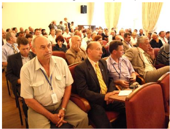
Photo-3: Experience of UNDP/MGSDP was presented at the VII Municipal Hearings

On June 29 - July 2 the UNDP/MGSDP supported the VII Municipal Hearing, initiated by the Association of Ukrainian Cities in Illichivsk (Odesa Region). The event aimed at discussion of local selfgovernment and decentralization at the expert level. Representatives of the local and state authorities and international organizations participated in the event.