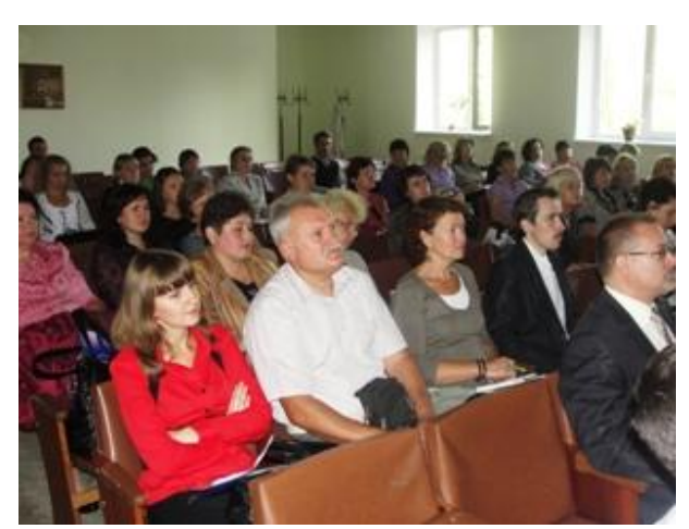
Photo- 5: The conference revealed that Ukraine is the only country to include sustainable development issues into education programs of all levels, starting with elementary school, secondary school and all the way to high education

The original academic course "Sustainable Development of Society" was developed by the Academy of Municipal Management under UNDP/MGSDP support in 2007. The goal of this course is to train current and future generations of civil servants, policy makers, CSOs, private sector, representatives of academia and scientific community on concepts and processes of participatory and sustainable local development. During 2007-2009, the Programme established partnership with four Ukrainian universities for introducing the course into their official curricula.