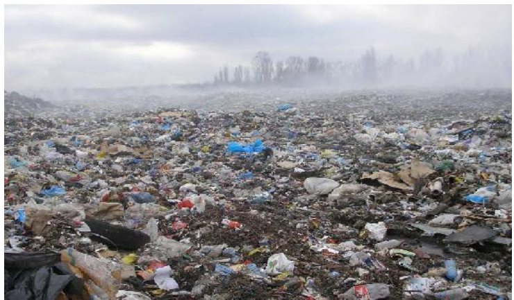
Photo-6: The landfill in Tulchyn is 100% full and inter-municipal cooperation offers a mechanism to solve this problem

The wastes at the landfill are not neutralized/deactivated and pose highest level of danger to human and environment. The municipality needs a new solid waste landfill which would respond to standards of sanitary and hygienic conditions and would not damage environment. The of partners Inter-municipal cooperation are: Tulchyn City Council (Co-financing of the project and leader implementing in the project/coordination); Suvorivska village Council (providing land for SW landfill), Kynashivska, and other.