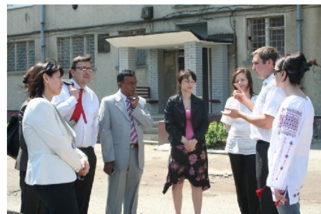
Photo – 12 : Meeting of the mission representatives with local community in Dolyna

local level, energy efficiency in public and multi-apartment buildings, introduction of the quality management system ISO 9001:2008 for municipal services. Also, the guests visited communities of ACMH "Oblisky-Zatyshok" (project on capital repair of gable roof) and ACMH "Pid Lypoyu on Pushkina, 8" (project on repair and heat retention lagging of external walls).