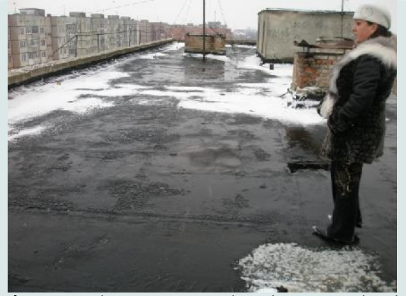
Photo -9: Local communities actively apply community-based approach in cooperation with local authorities in Rivne

But the roof was not the only problem. The house hot and cold water supply system required immediate replacement. The attempts to change the pipes in particles did not succeed. In order to block the water in the house the water in the whole microrayon should be blocked. The community decided at the General Meeting of the ACMH to prepare project proposal for replacement of hot and cold water supply pipeline.