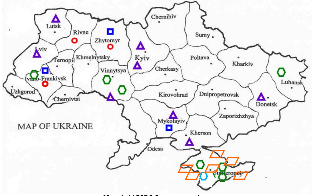
Map 1: MGSDP Programme Area

The Programme is operational in 23 municipalities and 5 settlements from 12 regions of Ukraine, namely Ivano-Frankivsk, Halych, Dolyna (Ivano-Frankivska oblast); Rivne (Rivnenska oblast); Zhytomyr, Novograd-Volynski (Zhytomyrska oblast); Mykolaiv, Voznesensk (Mykolayivska oblast); Kirovske (Donetska oblast); Hola Prystan' (Khersonska oblast); Kaharlyk, Ukrayinka (Kyivska oblast); Novovolynsk (Volynska oblast); Mohyliv-Podilsky, Tul'chyn, Kalynivka (Vinnytska oblast); Lviv (Lvivska oblast), Rubizhne (Luhanska oblast); Saky, Dhzankoy, Shcholkine, Bakhchysaray and Yevpatoria and settlements Krasnogvardiyske, Pervomayske, Nyzhn`ogirskyi, Zuya and Novoozerne (AR Crimea). Map-1 shows location of the Programme area in Ukraine by year of partnership.