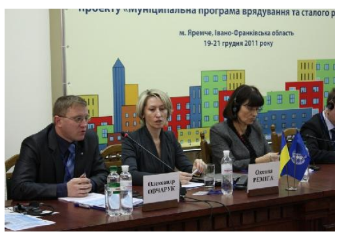
Photo- 4: The seventh meeting of the National Forum of partner municipalities gathered more than 70 participants