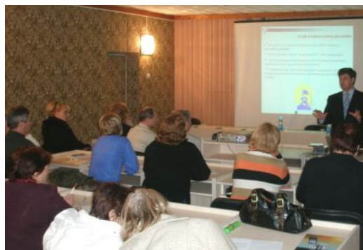
Photo - 11: In progress is the training for citizens in Saky, February 2008

As the result of trainings, citizens received comprehensive knowledge on the legislative framework for creation of the associations of co-owners of multi-apartment buildings, service