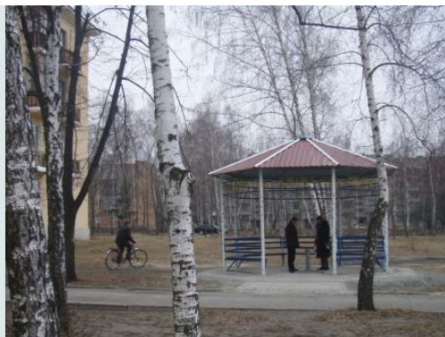
Photo – 6: Community members using the well-room for getting the quality potable water

The micro-rayon committee was registered by 50 representatives (36 men, and 14 women) of all the buildings of the micro-rayon in 2007. These people had numerous dialogues with the inhabitants of their own buildings, distributed informational materials in the micro-rayon to raise community participation in the project, and managed to jointly develop and implement the project. Out of the total project cost 129.8 thousand UAH, 10% was shared by the community members, 49.5% by Novohrad-Volynskiy City Council, and 40.5% - by UNDP/MGSDP. Also, the community managed to contribute to the project implementation non-financially, thus increasing the project cost by 1.1 thousand UAH (by 1%).