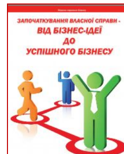
Photo – 20: Brochure “Starting Up your Own Business” (in Ukrainian)

Some feedback from the project beneficiaries is given in the Box – X.