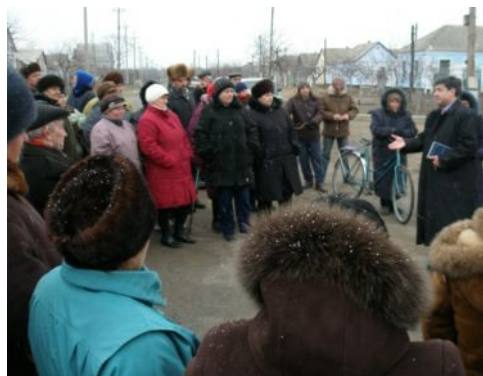
Photo – 2: Meeting with the community of citizens in Voznesensk in progress

The process followed for institutional development consists of holding dialogues with the stakeholders, forming the citizen-based organisations or networks, building their capacity on participatory governance, institutionalisation (official recognition) of their structures, and supervising their development by MGSDP/MSU teams. These steps are essential for laying foundation of good governance; building capacity of local community to forge partnership with local government and other development agencies and to pool local / external resources for realisation of development initiatives and sustainability of development efforts.