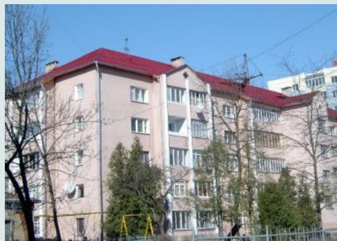
Photo – 10: The newly reconstructed roof of the building maintained by the ACMB “Suchasne Zhyttya”

The dwellers of the building realized that nobody would change their life for better and their building for the more beautiful one, if the community does not do it together, joining their efforts. For this purpose, the association of co-owners of multi-apartment buildings “Suchasne Zyttya” (“ Contemporary Life ”) was created in 2002 by the representatives of all 35 apartments of the buildings (21 men and 14 women).