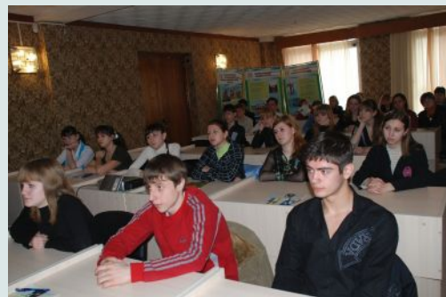
Photo – 12: In progress is training on gender for the local volunteers in Saky

Before coming to this training, I did not know anything about gender issues, not even the meaning of this word itself. But now I understand why it is so important to talk about this issue to the young people.