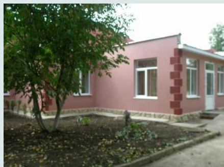
Photo – 7: Outside view of the reconstructed Rehabilitation Centre

The Centre was planned to have the swimming pool, playroom, physical training room, teaching complex, medical room, dining room and premises for the other services.