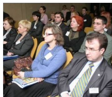
Photo – 23: Consumer Forum in progress

Also, representatives of MGSDP partner municipalities like Ivano-Frankivsk, Zhytomyr, Novohrad-Volynskiy, Halych, Ukrayinka, Rubizhne and others participated in the all-Ukrainian Consumer Forum dedicated to the World Consumer Rights Day, which was held in Kyiv from 11 to 13 March under support of the CSCN project. The Forum attracted around 150 Ukrainian consumer movement activists, including state authorities representatives involved in consumer rights protection, and local self-governance bodies, which contribute to building the national consumer policy. Ukrainian partner cities are expected to bring this knowledge for the benefit of their local stakeholders.