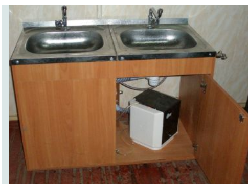
Photo – 5: Drinking water fountain “Krynichka 10” set up in all local schools

The School Network representing the interests of all local schools applied for participation in UNDP/MGSDP with the project on “Drinking Water Fountains”. The project was supported by the Programme (45% of the cost), Voznesensk City Council (45% of the cost) and the parents’ committees of the local schools. In course of project implementation, the contractor set up the reliable drinking water fountains “Krynichka 10” where the water is purified from the mechanic dirt, micro-algae and other dregdes, after which the new improved structure of the potable water is being formed and the water is mineralized. This equipment is allowed by the Ministry of Health Protection of Ukraine by their Regulated dated 23.07.99.