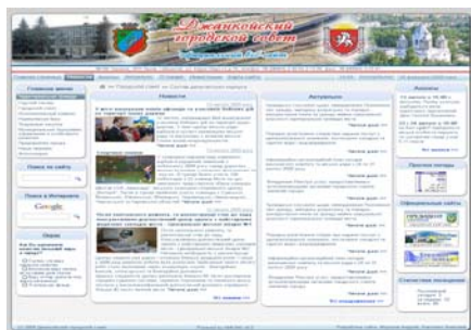
Photo – 7: Official web-site of Dzhankoy City Council – main page design

coordination for information updating and continuity of the website. UNDP/MGSDP supported the creation of the web-site and training for the officials and representatives from the municipality. For wider dissemination of the experience, the manual on web-site administration was prepared and published.