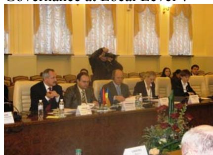
Photo -2: In course of the conference UNDP presented community-based development approach gains

On January 27, 2009, UNDP/MGSDP in cooperation with the Ministry of Regional Development and Construction of Ukraine, Council of Europe and other agencies have organised an International conference "Presentation of the European Strategy on Innovation and Good Governance at Local Level".