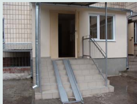
Photo – 12: Capital repair of entrances of the building has improved environmental, hygiene and sanitary conditions inside the building

The dwellers of fourteen-storeyed building on 2 Budivelnukiv St. are used to active life. They have received many rewards from their municipal authorities for active position. Establishing of ACMB and opening of its office will contribute to the prosperity of the community. Local authorities supported the desire of the dwellers to renew their house. A room for concierges was opened in the second porch. Since