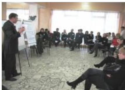
Photo - 15: The leaders from municipalities shared experience in mobilizing local communities

About 40 participants gathered in Saky (Crimea) on 11-14 March representing 19 municipalities to improve their leadership potential and learn how to apply gender-based analysis to local development programmes at the Annual Conference of the Municipal Support Units. The Forum was organized by a UNDP/MGSDP with support from Canadian International Development Agency.