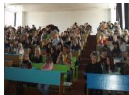
Photo - 11: Over 180 students attended a launching lecture on "Community-Based

In addition, the University will enhance capacity of the students, representatives of the bodies of local self-government and local communities to undertake bottom