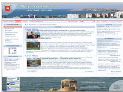
Photo – 8: Official web-site of Scholkino City Council – main page design