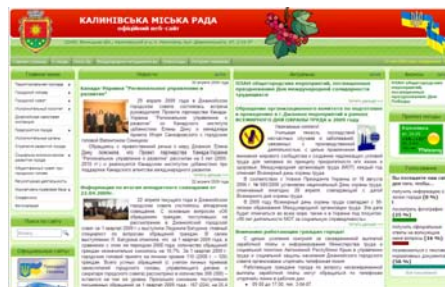
Photo – 9: Official web-site of Kalynivka City Council – main page design