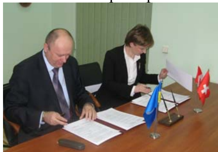
Photo-1: Joanna Kazana-Wisniowiecka, UNDP Deputy Resident Representative, and Anatoliy Tkachuk, Deputy Minister of Regional Development and Construction of Ukraine signing the Memorandum of Understanding

In cooperation processes, UNDP/MGSDP systematises and shares the lessons learned, disseminates its findings, organizes capacity building activities for civil servants at the local level and exchange of focal persons among the Programme and the Ministry to promote decentralization principles and strengthening of local self-government.