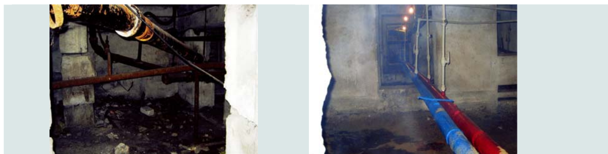
Photo – 6: The basement of the house of Association before and after repair.

During two years of Federation's operation, the personnel repaired and cleaned all basements. Also, they illuminated the premises and installed doors in order not to allow the strangers to the basement, the walls were whitewashed by lime and all central heating, cold water supply and sanitation pipes were replaced with plastic ones.