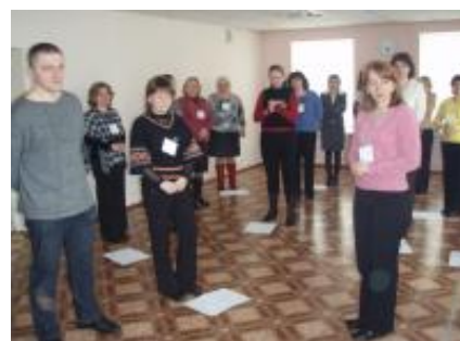
Photo - 17: The training prepared the teachers to teach a new course "Energy Saving and Climate Mitigation"

many regions of Ukraine. Similar actions are taking place in 20 foreign countries within the global project "School Project for Application of Resources and Energy". These trainings constitute the first stage of inter-municipal cooperation initiative between Dolyna and Novograd-Volynskiy municipalities on energy saving and housing reform which is an experimental activity of UNDP/MGSDP in 2009. For more information on this event, please visit http://msdp.undp.org.ua/index.php?news_id=120&language=eng