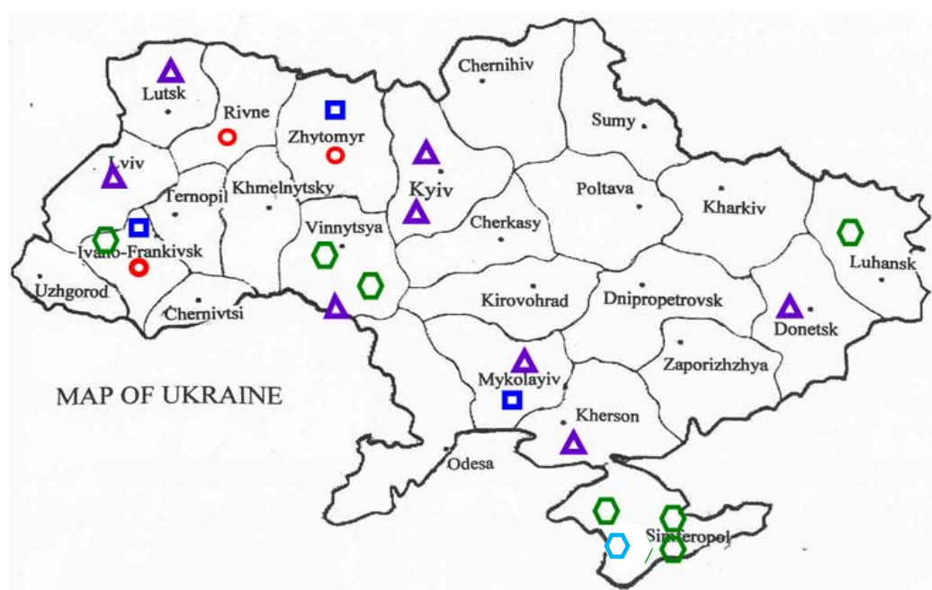
Map 1: MGSDP Programme Area

Map-1 shows location of the Programme area in Ukraine by year of partnership.