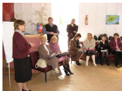
Photo - 19: 27 participants broadened their knowledge on gender and trained skills to deliver similar trainings

27 participants gathered on March 24-25 in Backchysaray (AR Crimea) and benefited from training on gender-based analysis for the teachers from four municipalities of AR Crimea. UNDP/MGSDP organised the training with support of Canadian International Development Agency.