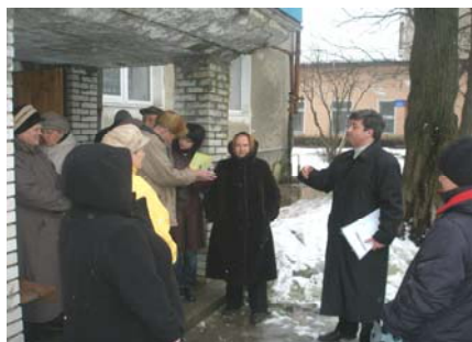
Photo – 4: Meeting of community “Zlagoda-2005” in Ivano-Frankivsk in progress

The process followed for institutional development consists of holding dialogues with the stakeholders, forming the citizen-based organizations or networks, building their capacity on participatory governance, institutionalisation (official recognition) of their structures, and supervising their development by MGSDP/MSU teams. These steps are essential for laying foundation of good governance; building capacity of local community to forge partnership with local government and other development agencies and to pool local/ external resources