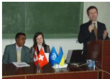
Photo - 10: UNDP offers sustainable development course to Rivne Water Management University students

The experience of the municipalities shows that there is a need for local scientists and practitioners educated on principles of sustainable development, social mobilisation and community-based approach. The topic of sustainable development is poorly represented in academic discourse in Ukraine; therefore, UNDP/MGSDP supported elaboration of curricular of the course on Sustainable Development and publishing of manual for this course.