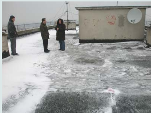
Photo-12: 150 members of community decided to unite their efforts and this benefited all dwellers of the house

The dwellers had many ideas for improving their house, but everyone agreed that roof reconstruction should be top priority. The roof leaked in many places allowing rain to penetrate through the defects and damages in the roofing material into apartments of upper floors, premises of entrances and elevators. All this negatively influenced the habitants' health, damages the building's electric wiring.