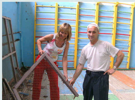
Photo-13: The community actively participated in the project at all stages and in monitoring and supervision

At the expense of the local budget funds 95000 UAH were allocated for these needs. But there were not enough funds in the City Council to cover the replacement of windows, rotten floors, plastering and painting works, repairs of the toilets and cloakrooms. We needed 150000 UAH to fulfill this work. The operation of the gym could have been stopped any moment by the decision of the Session. The critical situation occurred. There were few variants of solving the problem: to wait till the City Council will be able to provide funds needed, rent the premises of the local Public Club to conduct the lessons of physical training or to look for a partner which will help to realize the idea of thorough repair. The community chose the third variant.