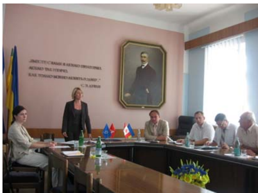
Photo-7: Yevpatoria municipality became the ninth partner of UNDP/MGSDP in AR Crimea

The authorities of Yevpatoria municipality and representatives of United Nations Development Programme signed Partnership Agreement between UNDP and Yevpatoria City Council and between UNDP and Novoozernivsky Settlement Council within UNDP/MGSDP. The Partnership Agreements was signed on September 4 in Yevpatoria. The parties agreed to practice the principles of sustainable development and assist local communities, represented by community-based organisations to solve their priority problems. Yevpatoria municipality became the ninth partner in AR Crimea of UNDP/MGSDP. Before this, four municipalities (Saky, Dzhankoy, Scholkino and Backchysaray) and four settlements (Nyzhnogirskiy, Krasnogvardiyske,