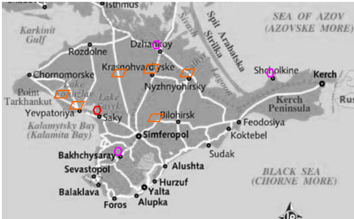
Map-2: Location of the Programme area in AR Crimea by year of partnership