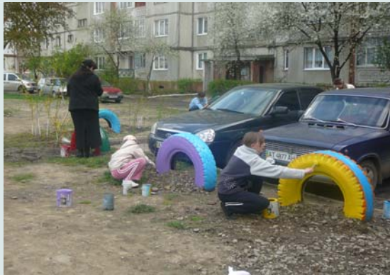
Photo-9: The community members take active part in improving adjacent territory

implemented, visited housing committees, that have already finished the implementation of the projects.