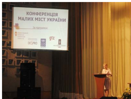
Photo-2: The Prime Minister suggested to consider system ISO 9001:2000 for composing new HR typical tables for organising city council charts

our information centre, taking into consideration the wishes voiced by the local people. Also, we have updated the "Policy of Quality of Executive Bodies in Voznesensk City Council" by adding twelve European good governance principles there". For more information, please review UNDP/MGSDP web-site http://msdp.undp.org.ua/index.php?news_id=130 .