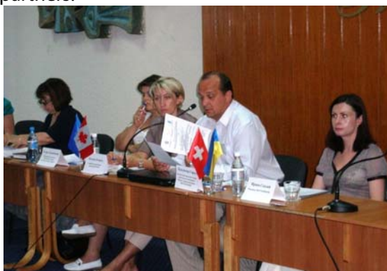
Photo-3: The mayors suggested to support energy-saving initiatives, water management and improving quality of municipal services

The purpose of the workshop in Yalta was to share the vision on future Programme activities among SDC representatives, UNDP management, the mayors of partner municipalities and Programme partners.