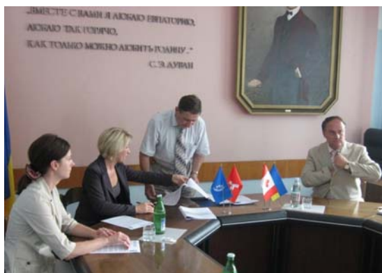
Photo-8: Yevpatoria City Mayor and UNDP management sign the Partnership Agreement establishment of public-private partnership. Please review UNDP/MGSDP web-site for more information http://msdp.undp.org.ua/index.php?news_id=132&language=eng

Yevpatoria City Council initiated the partnership, which envisages strengthening institutional capacity of the municipality at all levels and rising efficiency of local government.