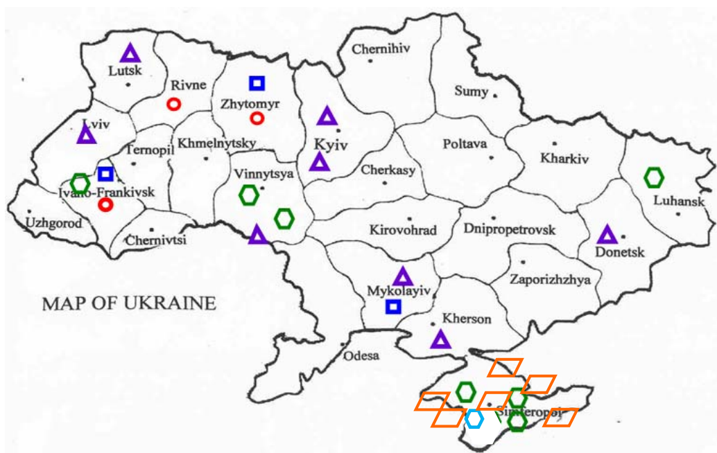
Map 1: MGSDP Programme Area

Map-1 shows location of the Programme area in Ukraine by year of partnership.