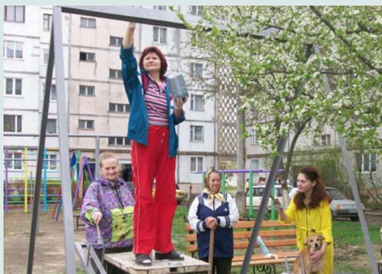
Photo-10: The slogan of HC is 'Let's unite to make our lives better, we're worth of it!'

The Housing Committee organized the improvement of the house territory. In autumn of 2007 6 trees were bought in Botanical Garden and planted in the house yard, in 2007-2008 more than 40 ornamental bushes were planted, received from the greenery and bought from the City Council budget. Due to the help of the City Council in 2008, the playground for children was installed in the yard, surrounded by beautiful forged benches. Furthermore, due to the residents' efforts, the old metal playing constructions were cleaned from rust and repainted. Every year, during the pre-Easter cleaning the residents put the yard in order, lime the trees and bushes, plant flowers near the windows.