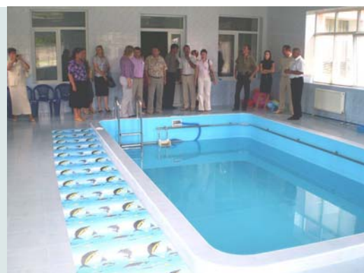
Photo - 18: The participants attended rehabilitation centre Angel Nadiyi in Mochyliv-Podilskyi

The participants made the recommendations for the bodies of local self-government on improving quality of public service delivery in Urban Ukraine: