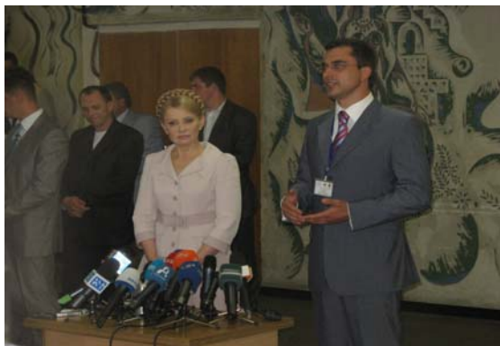
Photo - 1: "If we change nothing for communities - we will not change Ukraine", said Yulia Tymoshenko, the Prime Minister of Ukraine

Ukrainian Prime Minister suggested looking at the international standards, namely Municipal Services Quality Management System ISO 9001:2000, when composing the new HR typical tables for organising city councils' charts.