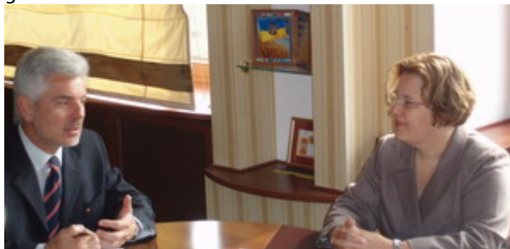
Photo-18: Volodymyr Khomko, Rivne City Mayor and Ricarda Rieger, UNDP Country Director in Ukraine

During the meeting, the parties shared their opinions about the expansion of the cooperation and founding of the new projects. Ms Rieger notified that she highly appreciates all the efforts that local government puts into high-quality implementation of the UNDP projects and understands that during the crisis Rivne authorities have to focus efforts on the cost-sharing of the projects by the local government.