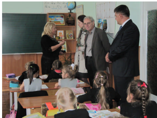
Photo – 8: During the visit to SCO “Oberig” in Rivne, reviewing the project site “Installation of heat loss reducing PVC windows”

The scope of the Mission included assessing process of project implementation and its guidelines, mechanism of cooperation with local communities and local government, cooperation with focal ministries of the Programme, in particular the Ministry of Housing and Municipal Economy and the Ministry of Regional Development and Construction and the capacity of the Municipal Support Units for supporting community initiatives on sustainable development. Juerg Christen aimed to provide suggestions on the process of dissemination of project findings, lessons learned and experience at the nation-wide level.