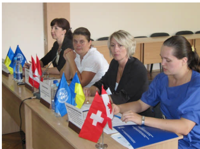
Photo-1: The participants of the meeting have identified Project’s priorities for 2011