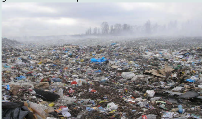
Photo-2: Existing landfill in Tulchyn cannot cope any more with growing amount of residential solid waste of the rayon

The wastes at the landfill are not neutralised/deactivated and pose highest level of danger to human and environment. The municipality needs a new solid waste landfill which would respond to standards of sanitary and hygienic conditions and would not damage environment. Potential partners of Inter-municipal cooperation are: Tulchyn City Council (Co-financing of the project); Tulchyn City Council (potential leader in implementing the project/coordination); Suvorivska village Council (providing land for SW landfill), Kynashivska, and other.