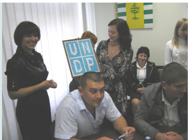
Photo-5: Rubizhne City Council presented experience gained in partnership with UNDP/MGSDP

Also, Rubizhne City Council presented the local policy for promoting establishment and operation of the Associations of Co-Owners of Multi-Apartment Houses (ACMHs). The guests met the representatives of ACMHs "Nash Kvartal", "Nash Kvartal -2", "Nash Kvartal-4" and learned about the projects on porches and corridors insulation, implemented with UNDP/MGSDP support. For more information please review UNDP/MGSDP web-site http://msdp.undp.org.ua/index.php?news_id=152 .