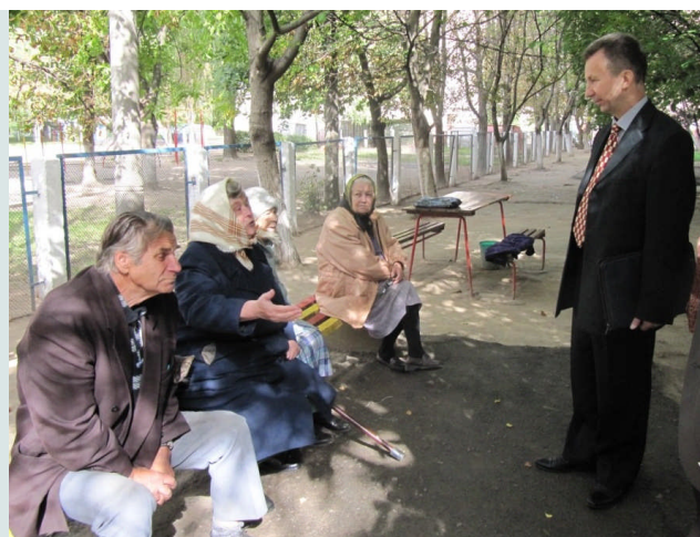
Photo-3 : Local communities and authorities in Rivne implement projects using MGSDP mechanism without UNDP financial support

In 2010 cooperation of the communities with MGSDP was useful for many residents of our city. The communities involved into Project implementation became more confident, self-empowered and able to solve common problems, consolidated, active and friendly. Now they believe in their strength and understand they can improve quality of their life. Considering activity of the communities, acquired experience and positive result in implementation of local initiatives the decision was made to increase funding of the Project activities. Therefore, to implement the activities with MSDP in 2010 UAH 3 500 000 were allocated from the City Council budget. The Advisory Committee approved 34 projects with the total cost UAH 4,6 million, 30 of them are in the process of realization, 7 projects are co-financed together with UNDP/MGSDP. The inputs are as following: UAH 3,5 mln contributed by municipality, UAH 200 714 contributed by UNDP/MGSDP, and UAH 898 008,56 contributed by local community.