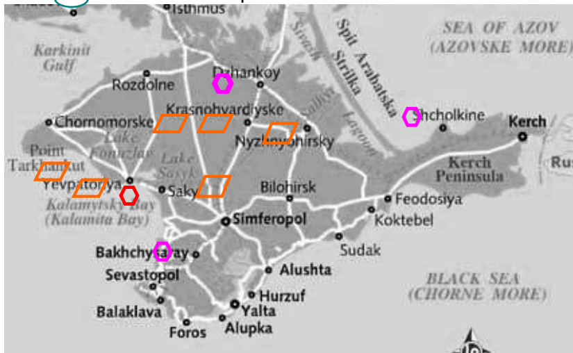
Map-2: Location of the Programme area in AR Crimea by year of partnership