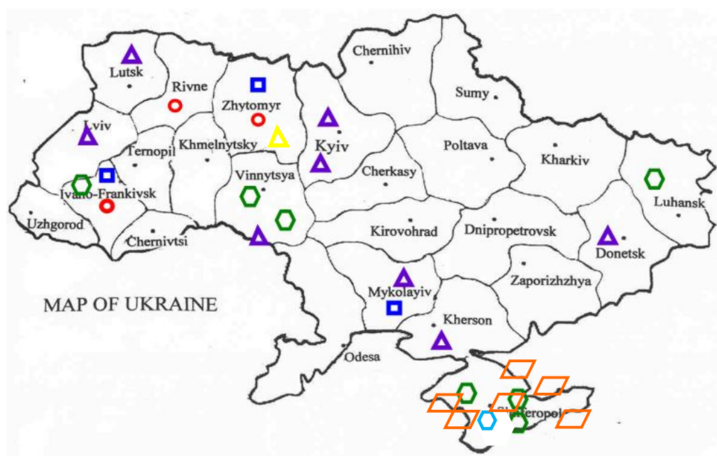
Map 1: MGSDP Programme Area