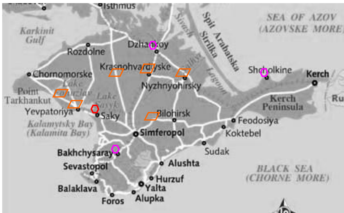
Map-2: Location of the Programme area in AR Crimea by year of partnership